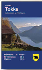
Map: Tokke 1 : 50 000

You are responsible for your own safety during the walk. Treat the countryside and grazing animals with respect. Take only photos, leave only footprints. Please take your rubbish home with you. Enjoy the trip!