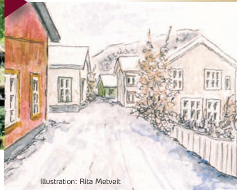
Illustration: Rita Metveit

A SMALL "TOWN" began to form in the centre of Fyresdal in the 1870s. At the turn of the 20th century 129 people lived in 25 houses in what was known as Folkestadbyen. Residents of the "town" made their living from providing services to others. It