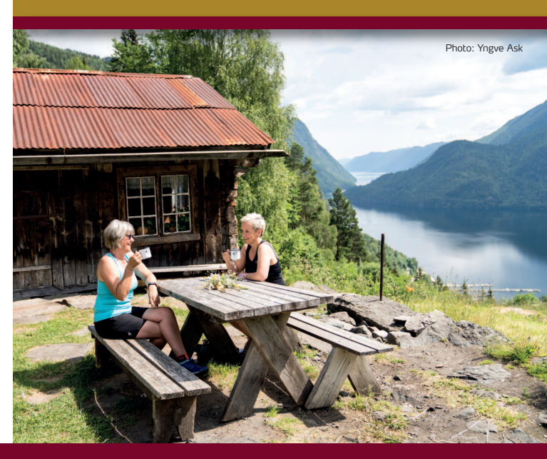
WEST TELEMARK MUSEUM IN EIDSBORG Museum – stave church – activitypark.

THEME Following in the footsteps of the girls from Rui